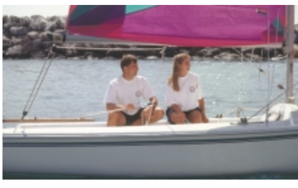
*All measurements are approximate and subject to change without notice.

Like every Catalina, the Catalina 16.5 is built with a one piece hand laminated deck. The hull is also hand laid for strength and light weight. Both models come with self-bailing cockpits, a large forepeak storage compartment with a watertight hatch. Also included is anodized mast and boom with adjustable outhaul, stainless steel standing rigging, complete Dacron sails and running rigging.